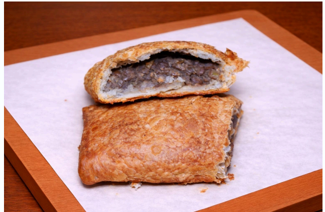
poppy seed pastry