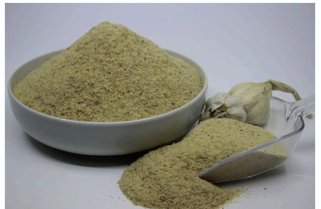
ground garlic powder