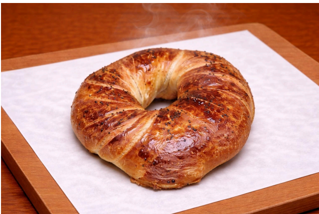
Thin-crust plain flatbread