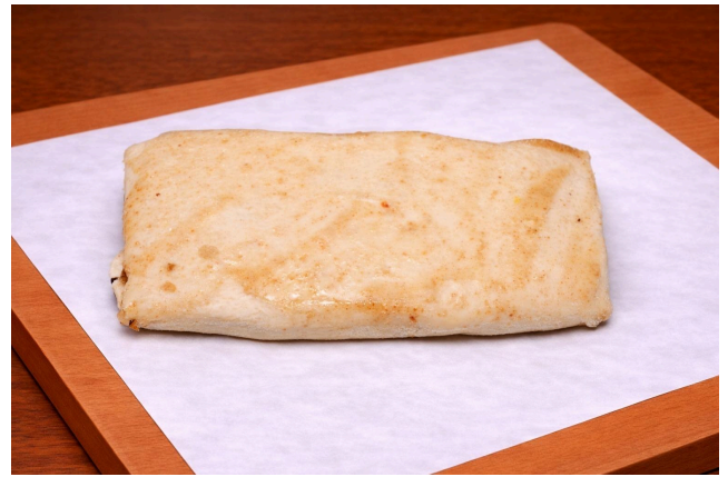
Cheese-filled raw pastry