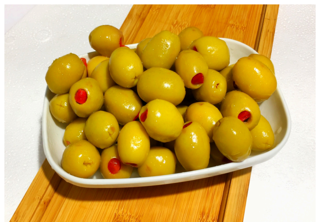
green olives with chili peppers