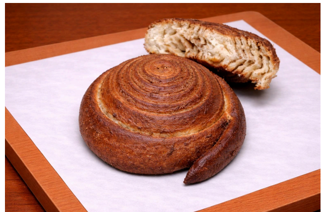
Thin-crust plain pastry