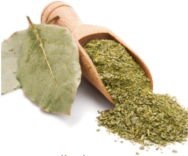
ground bay leaves