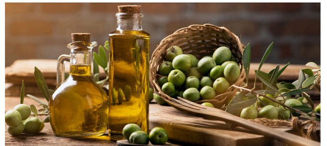
bottled olive oil