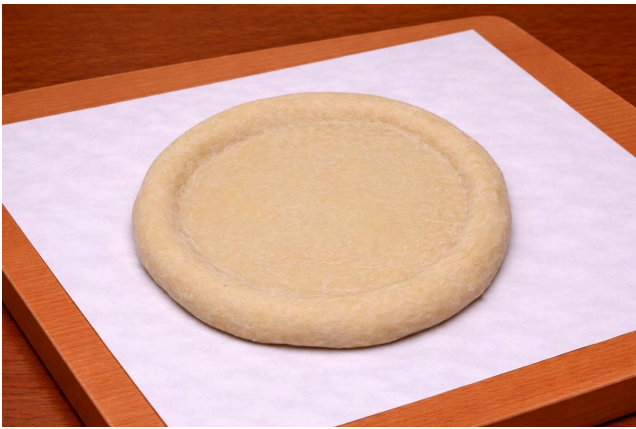
Chocolate-filled raw pastry

Because for Biscara, good food is not just a product—it's a promise of trust.