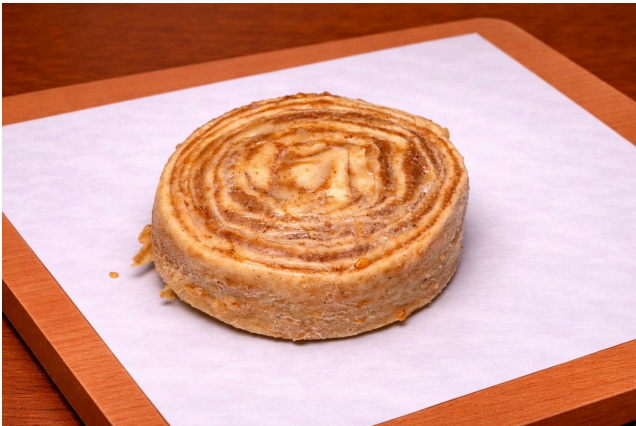
Thin-crust tahini pastry