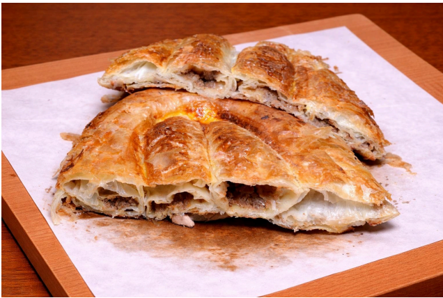
Cheese-filled pastry slices