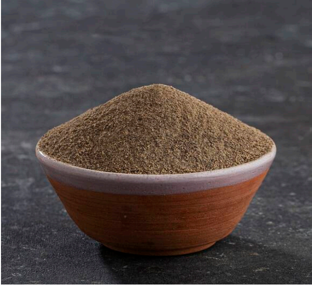
ground black pepper