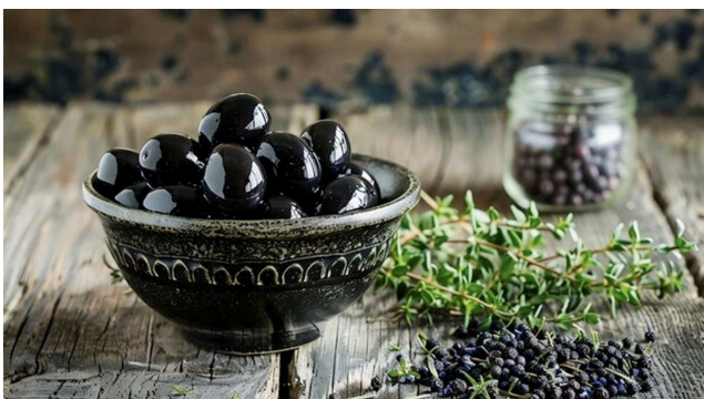
Black olives—a staple on every table