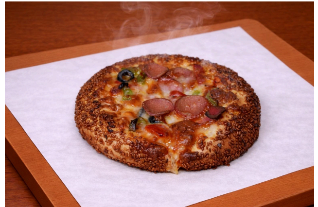
sesame seed pizza