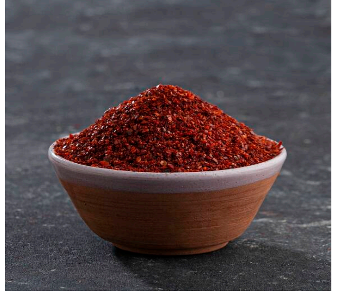
ground sweet paprika