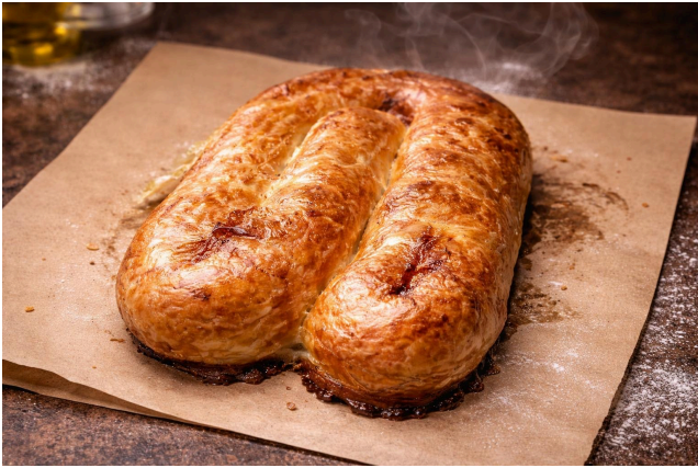
Ground beef börek (whole)